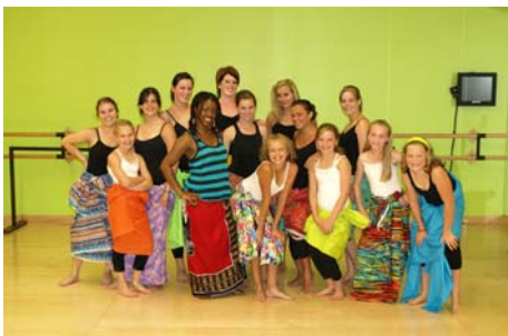
TA-DA Company Dancers at Debbie Allen Dance Academy

This past July the Ta-Da Dance Company traveled to California for performances at San Francisco's Fisherman's Wharf & Disneyland. This was our 20th Summer touring the U.S.A. and without doubt the best trip ever!